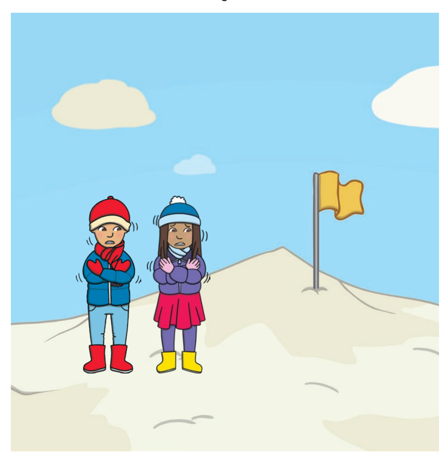
"It is freezing. We must go down the track."