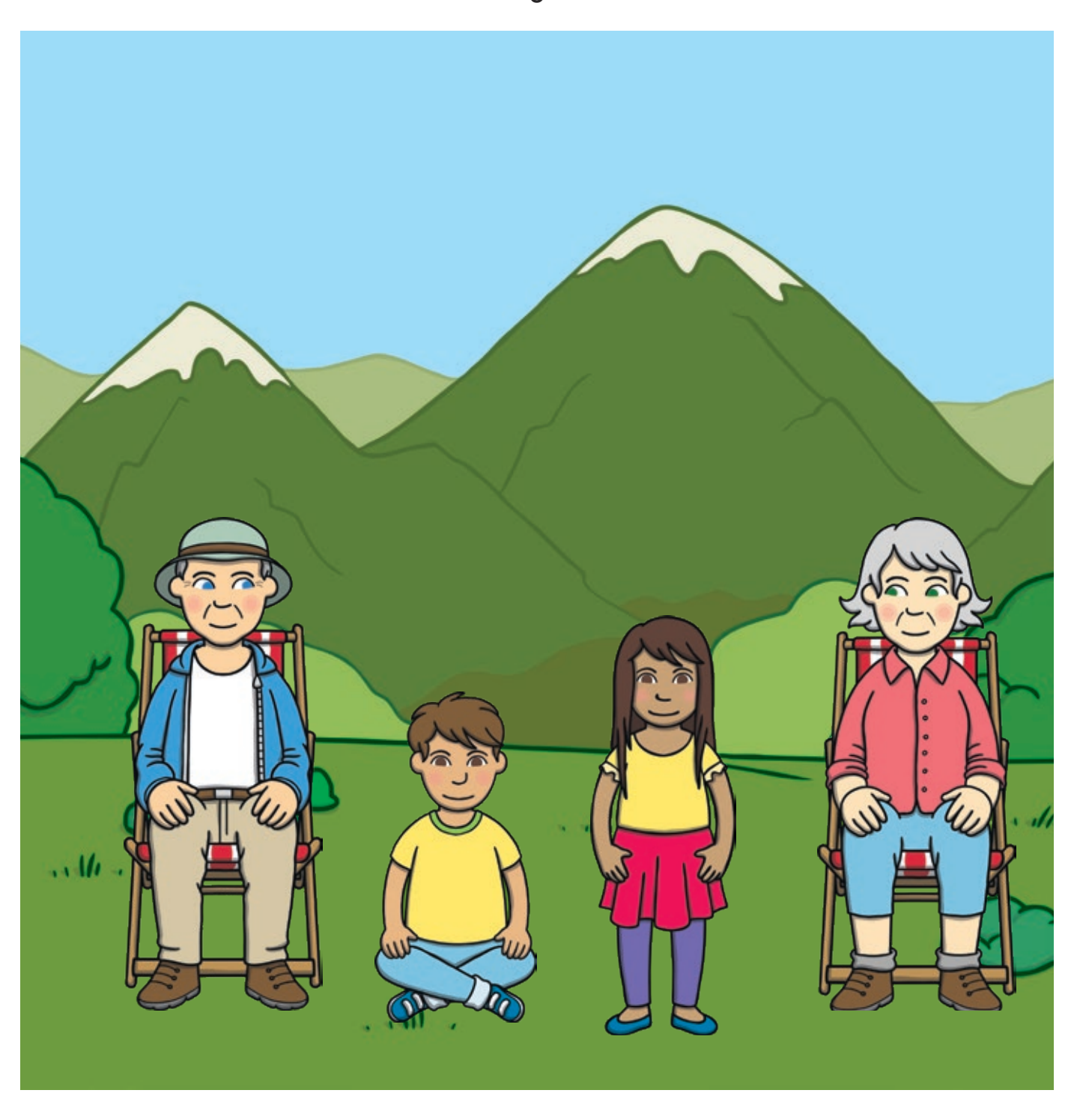
"It is good to see you again, Gran and Grandad."