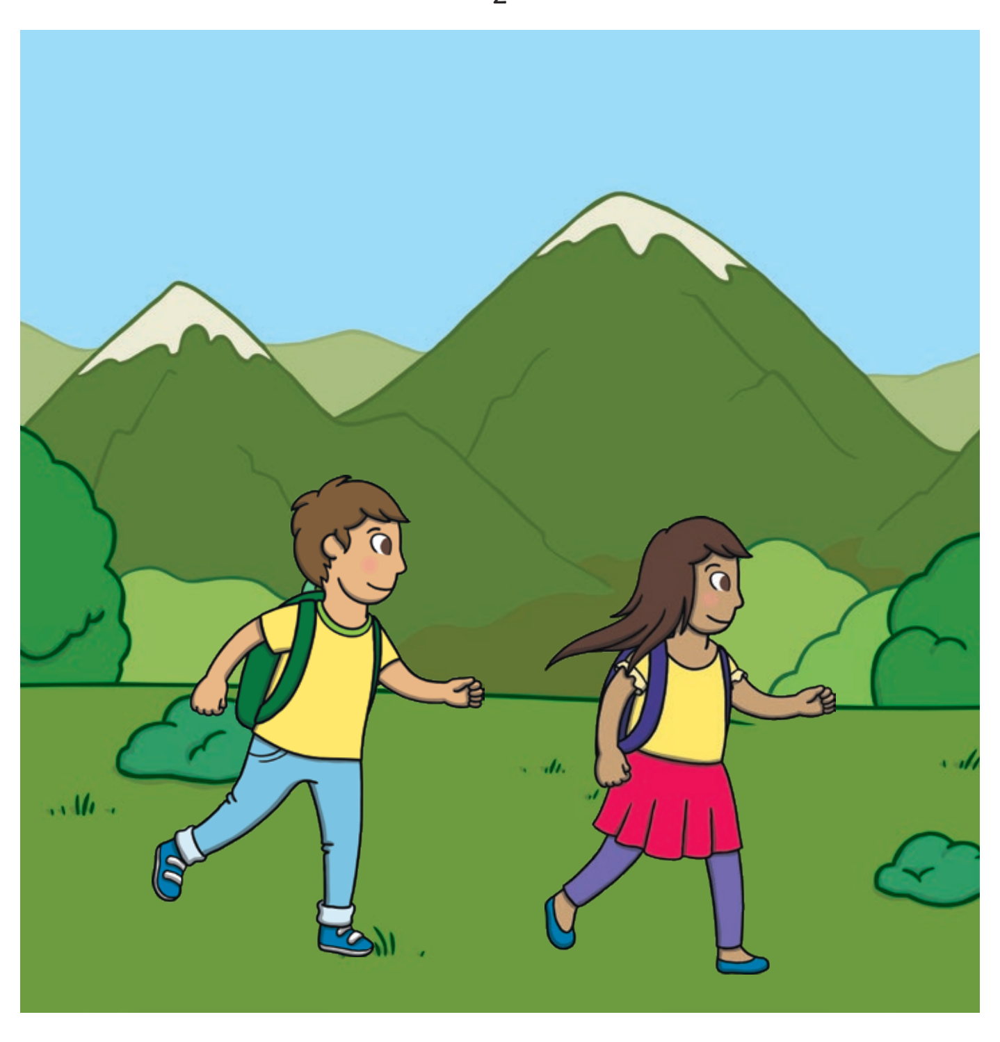
"Let us look for things along the track."